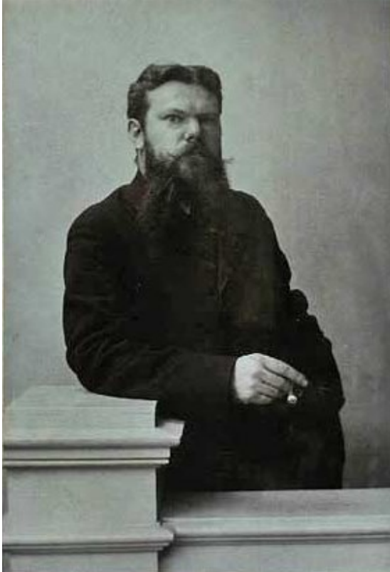
Frederik Borgbjerg in the 1890s.

While he originally intended to become a priest, Borgbjerg's growing political awareness led him to drop out of university and join the ranks of the burgeoning social democratic labor movement by the late 1880s — one of the first intellectuals to do so.