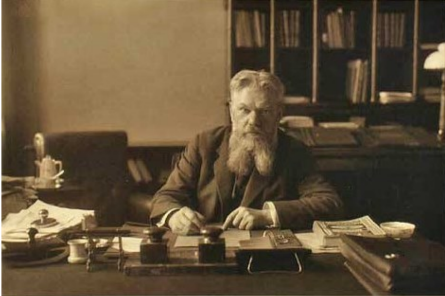
Frederik Borgbjerg in the 1920s. (Royal Library, Copenhagen)

Finally, at the macro level, the fate of Danish social democracy is tangled up with world history. The Stalinist turn of the Russian Revolution (which Borgbjerg had initially celebrated in 1917) and the reform-revolution schism of the international labor movement pushed the Scandinavian social democrats — who were already on the brink of winning government power by the 1920s — further toward the path of class compromise and labor demobilization. After World War II, the animosity between Communists and Social Democrats resulted in the latter choosing to side entirely with the United States in the Cold War. H. C. Hansen, the Social Democratic prime minister from 1955 to 1960, was even revealed to have been a CIA informant around 1945.