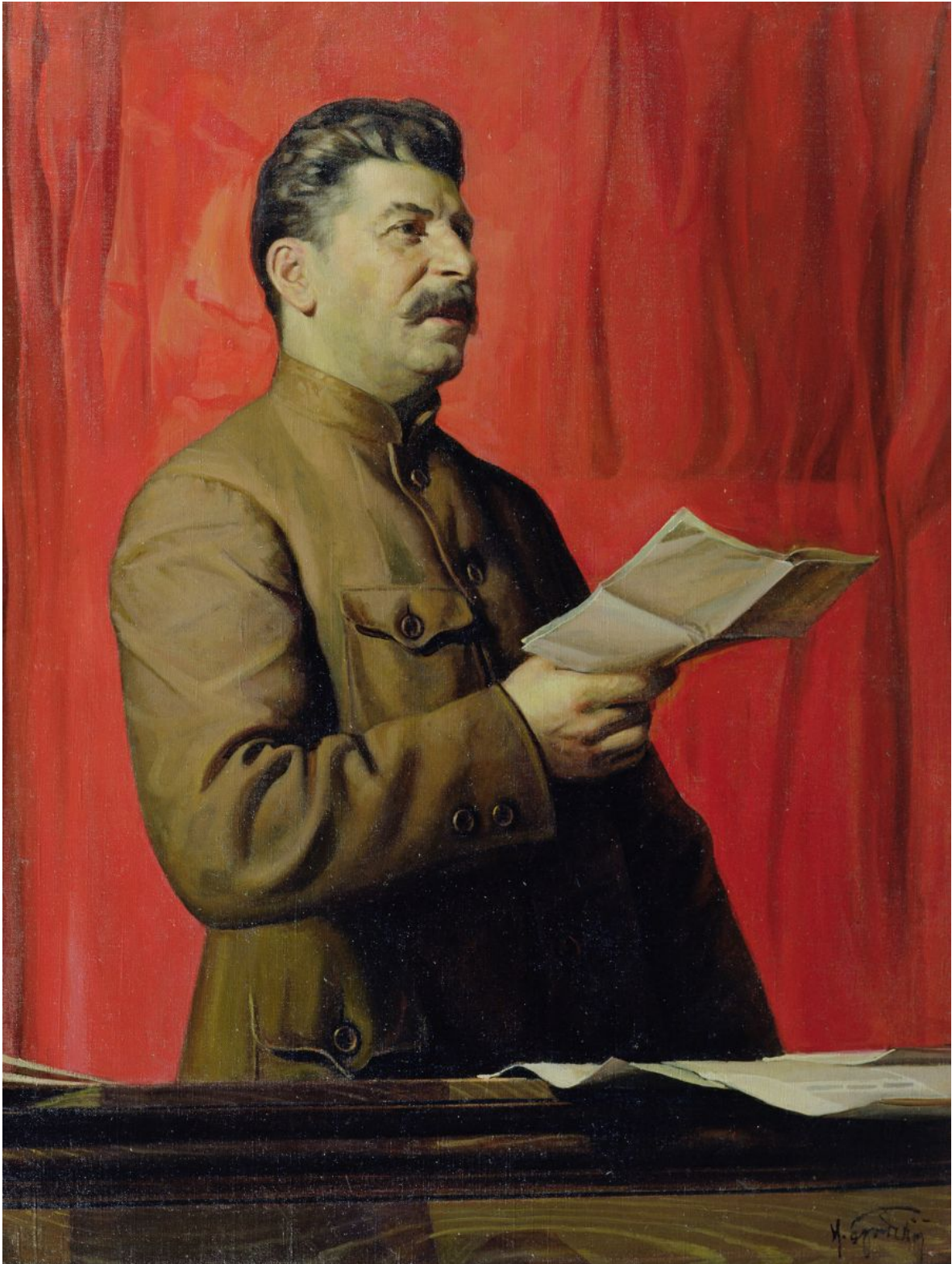
Portrait of Josef Stalin (1933) by Isaak Izrailevich.

In 1934, H G Wells arrived in Moscow to meet Soviet writers interested in joining the international PEN Club, of which he was then president. While there, Stalin granted him an interview. His