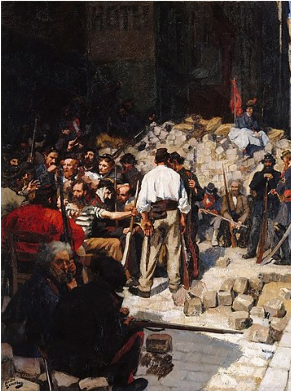
A 1911 painting by André Devambez depicting a barricade in the Paris Commune.

For the seventy-two days the Commune existed, such emancipatory measures were proclaimed and had begun to be applied, but, beyond these formal policy reforms, the entire city seemed captured by an extraordinary effervescence and engaged in a process of social transformation from below. Artists and intellectuals — Paris was then the capital of European literary bohemia — created their own federations. Popular newspapers and graphic arts flourished for two months in a country whose official culture was radically hostile to the lower classes, usually depicting them as a despicable “mob.”