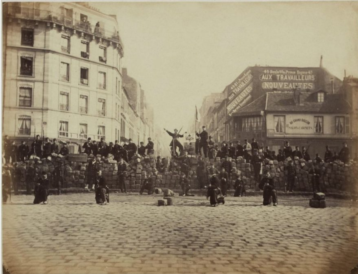
A barricade in the Paris Commune, March 18, 1871.

The Paris Commune ended on this day in 1871, after just two months in power. How do we explain, Enzo Traverso asks, the longevity and freshness of the memory of a fleeting revolutionary government?