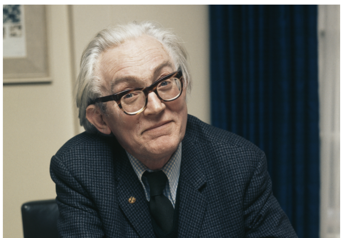
British Labour Party politician Michael Foot in 1974.

Michael Foot was a giant of Labour Party politics. The attempts by Labour centrists to diminish his legacy after his death only reveal the extent to which his socialism, like that of Jeremy Corbyn, threatened the British establishment.