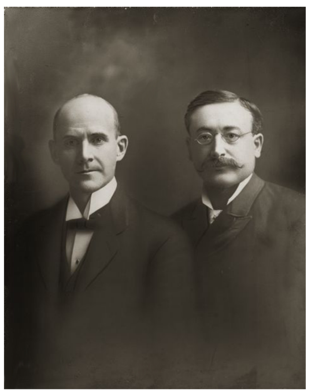
Debs and Victor Berger in 1897. Debs tended to hover above intraparty disputes, much preferring speaking tours to factional fighting. But no one doubted where he stood on key questions. In 1905, he cofounded the Industrial Workers of the World (IWW), a radical alternative to the "labor-dividing and corruption breeding craft unions."

While he stepped away from the IWW before the decade's conclusion — thinking its focus on direct action at the workplace was crowding out political action — Debs never second-guessed its basic principles. Any effort in the political arena that failed to forge the working class into a fighting force — or elevated professional and affluent classes above workers as the catalyst of social transformation — was unworthy of the Socialist Party. Nationalization, for instance, was desirable only if it gave workers more control over the economy. Similarly, a party without a strong working-class foundation would become indistinguishable from middle-class reformism, averse to attacking the roots of tyranny and oppression in society.