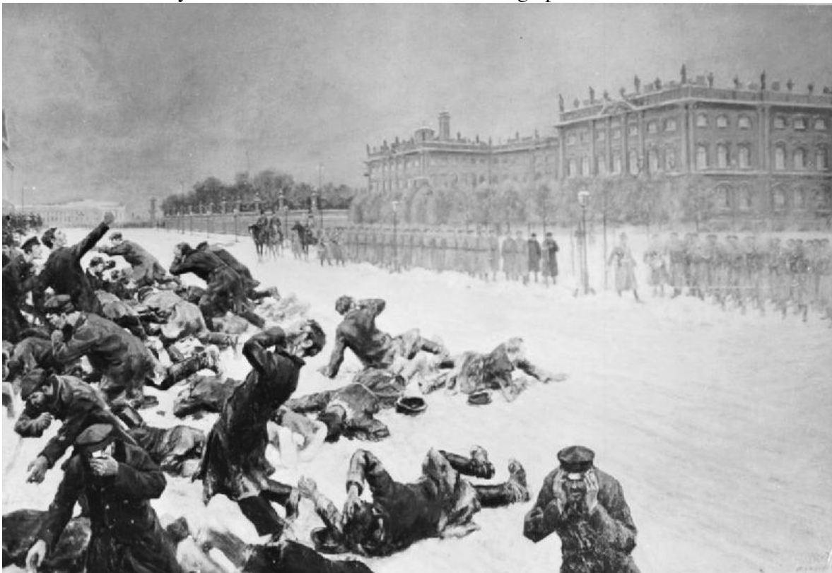
An artistic impression of “Bloody Sunday” in St Petersburg, Russia, when unarmed

While in late 1904 liberals and progressives had successfully pressed for workers insurance, the abolition of censorship, and expanded local representative government, the Russian Empire still lacked a federal parliament. In January 1905, strikes erupted in multiple cities, culminating in a peaceful march in St Petersburg of men, women, and children, singing hymns and brandishing a petition demanding an elected parliament. Troops fired on the marchers before they could reach the Winter Palace, killing upwards of one thousand.