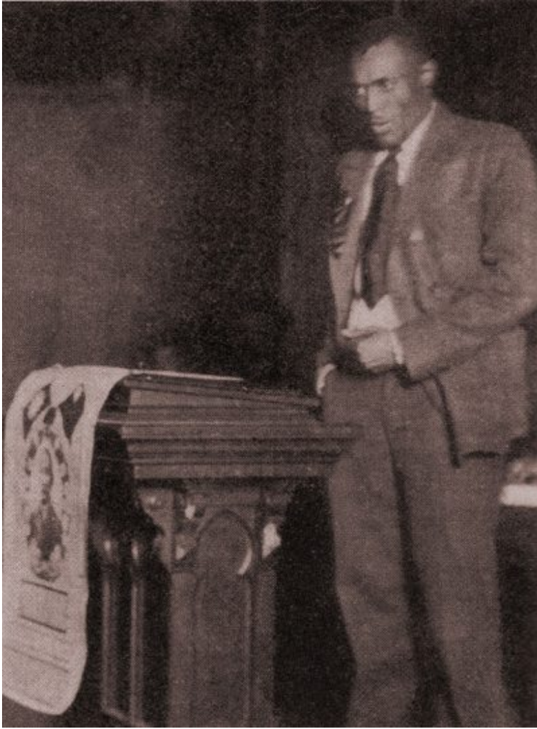
Lovett Fort-Whiteman at the founding of the ANLC, 1925.

In 1925, the party took its biggest step yet in confronting the color line, organizing a new body — the American Negro Labor Congress — to advance black working-class radicalism. The organization was largely the vision of one man: Lovett Fort-Whiteman . After joining the CP shortly after its founding, Fort-Whiteman had spent time in Russia as a student at the Comintern’s University of Toilers of the East, a school for revolutionists from oppressed countries. When he returned to the United States, Fort-Whiteman was ready to put what he had learned into action. He was, however, disappointed with the half-hearted attempts the party had made so far at building a base among black workers. In late 1924, he complained to the Comintern that the American party had not made “any serious or worthwhile efforts to carry communist teaching to the great masses of American black workers.” He proposed the ANLC to remedy this failure, and the Comintern enthusiastically agreed. The ANLC was launched in mid 1925. The black press greeted the new organization enthusiastically, impressed by the vigor with which the