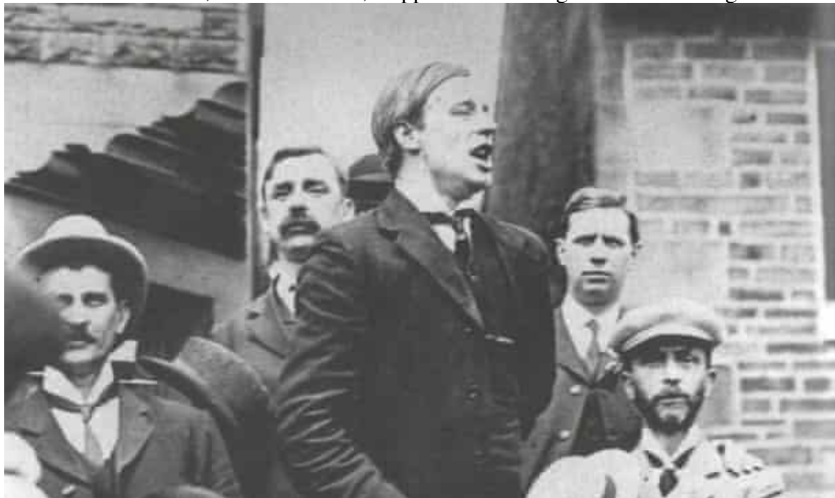
Victor Grayson speaks after his 1907 electoral victory.

Instead he found himself in the pay of the British government who needed a pro-war socialist voice to calm industrial unrest in the Commonwealth. Grayson was dispatched to Australia and then New Zealand, and ended up on a recruitment drive for more men for the war effort. It was in New Zealand that Grayson signed up for the infantry and joined the ANZAC forces which travelled back to Europe. Private Grayson found himself in the trenches at the Battle of Passchendaele. He was wounded by shrapnel and after spending many rain-sodden hours under torrential rain and German rifle fire, he was rescued, shipped back to England and discharged.